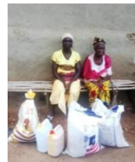
COVID Relief for Rural Villagers