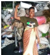
Unwed Mothers Receive Business Start-ups