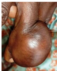
Medical Emergencies Sicknesses and Surgeries